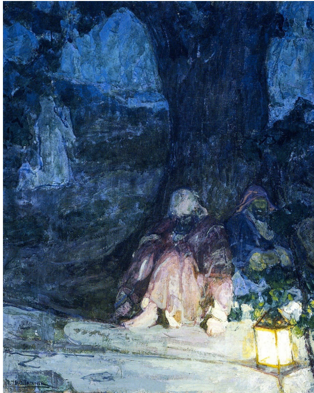
HENRY OSSAWA TANNER (1859-1937)